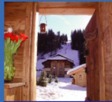
View of the ski lift from our front door

That means a different ski landscape every day of your stay, if you are after variety, and skiing that varies both in difficulty (or ease) and nature, from the romantic (gentle narrow runs through thick forest) to the exhilarating (fast wide and narrow runs above and below the tree line).