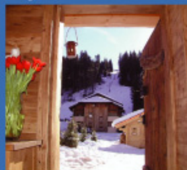
View of the ski lift from our front door

650 kms of groomed piste (and off piste if you are so inclined) where you can travel across snowy borders with not a border post in sight.